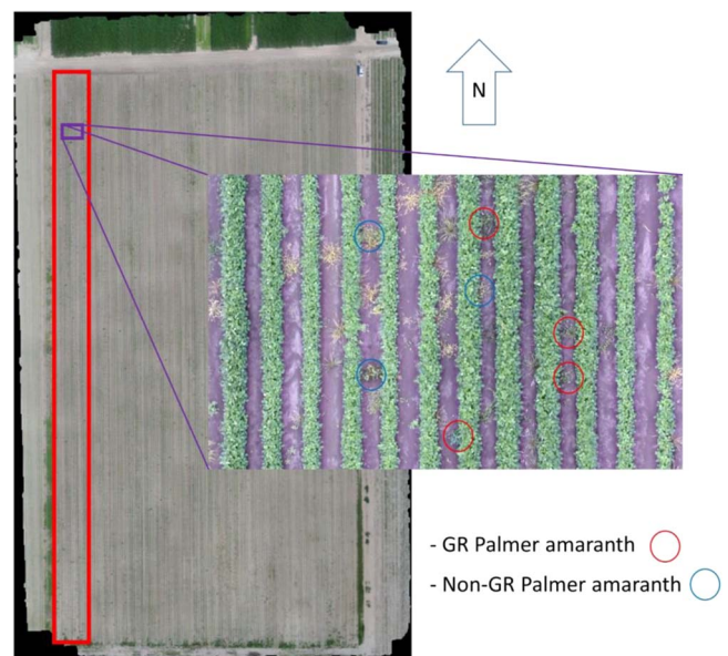
Figure 3. The entire soybean field with the 16 rows confined by the red rectangular box and GR and GS Palmer amaranth identified from postspraying, UAV narrow-band, multispectral imaging.